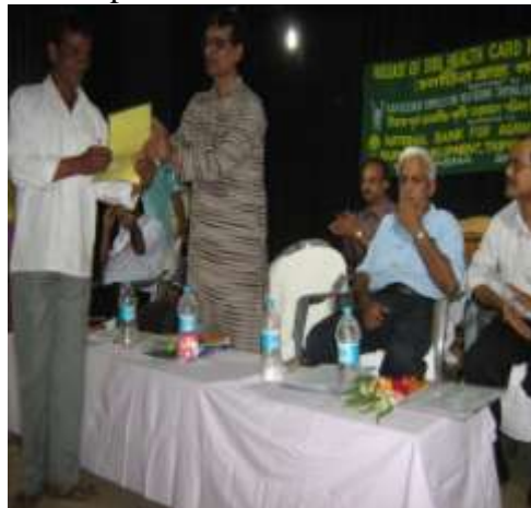
Shri Joygovinda Debroy, Hon'ble Minister of Science and Technology, Govt. of Tripura

. A continuous programme on training of farmers for effectively using the card is also in operation.