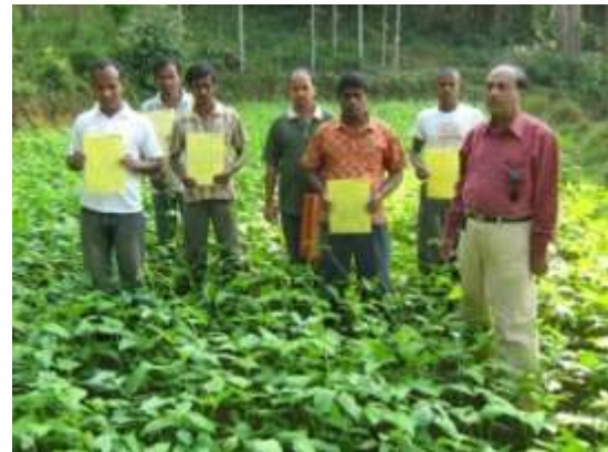
Discussion at Ankur F/C in South Tripura