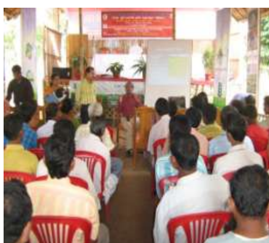
Training on the Use of SHC