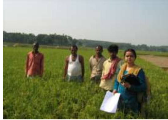
Discussion with farmers regarding the use of SHC at Bishalgarh