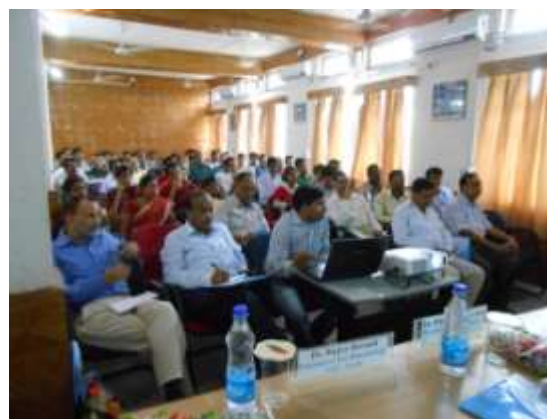
Participants in soil health and soil fertility management programme