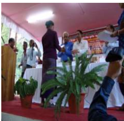
A woman farmer receiving a SHC In South Tripura

. A continuous programme on training of farmers for effectively using the card is also in operation.