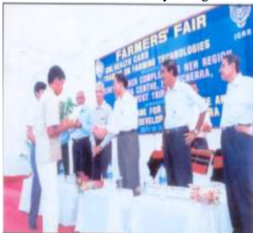
Shri Aghore Debbarma, Hon'ble Minister of Agriculture, Govt. of Tripura

Soil health card was released by Hon'ble Minister of Agriculture, Govt. of Tripura, Shri Aghore Debbarma and SHC was distributed among 100 farmers belonging to six farmers club from Jirania, Kalikapur, Lefunga, Bamutia and Bishalgarh in West Tripura. Soil health card was thereafter released by Shri Joygovinda Debroy, Hon'ble Minister of Science and Technology, Govt. of Tripura at Bagma, South Tripura and farmers from 5 club of that locality had received soil health card. A continuous programme on training of farmers for effectively using the card is also in operation.